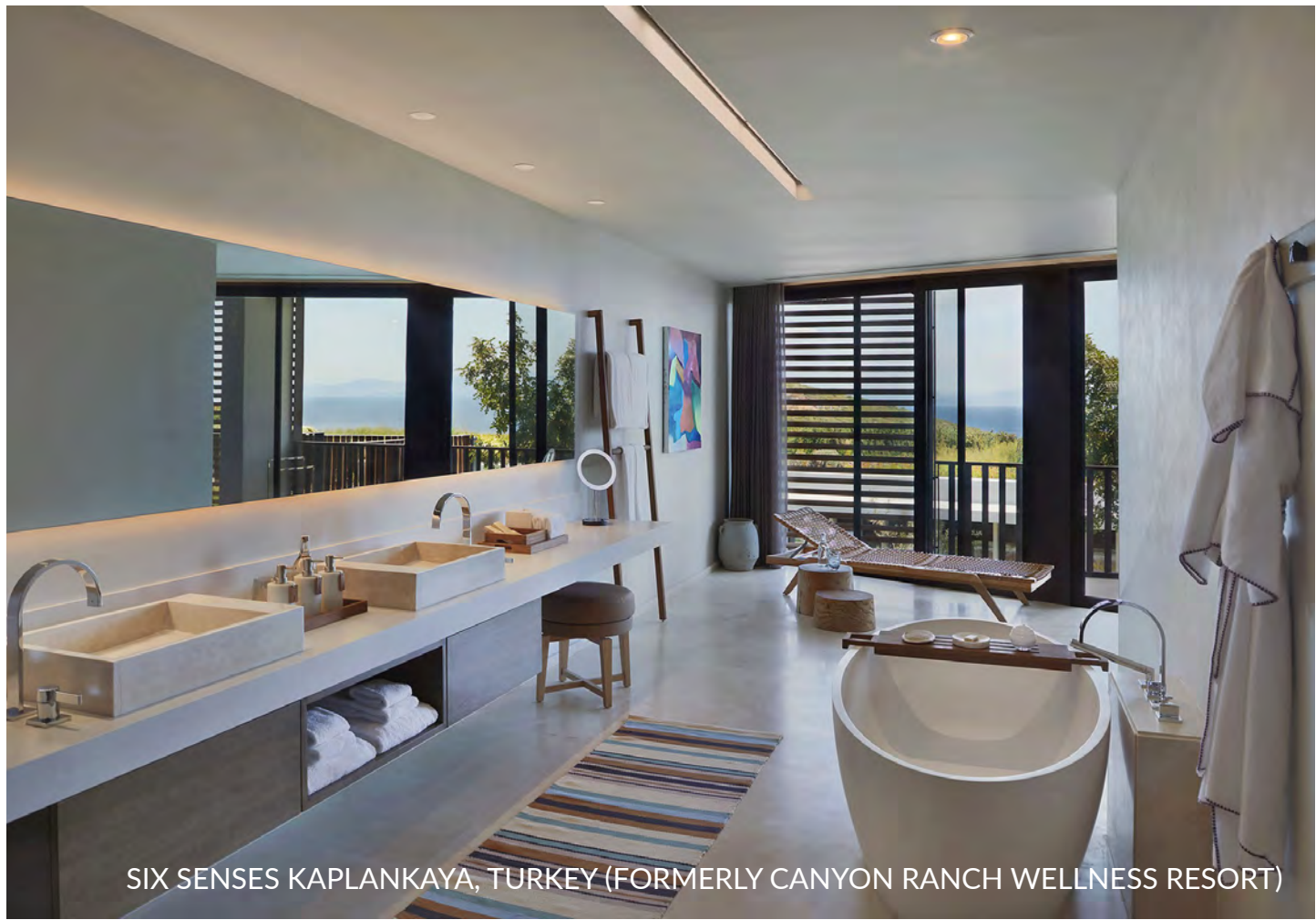
SIX SENSES KAPLANKAYA, TURKEY (FORMERLY CANYON RANCH WELLNESS RESORT)