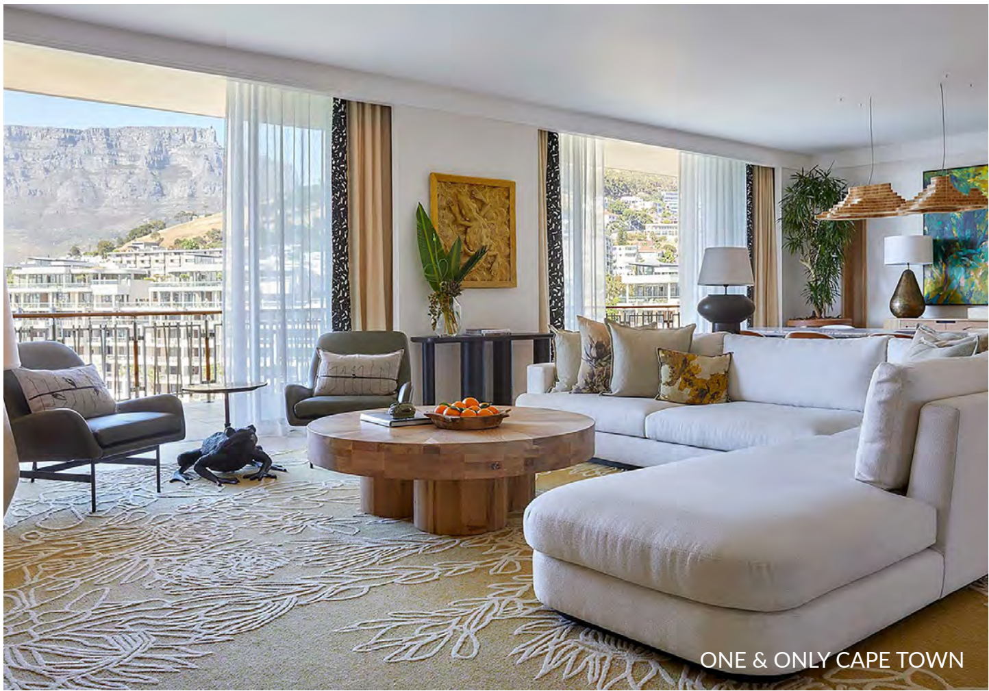
ONE & ONLY CAPE TOWN