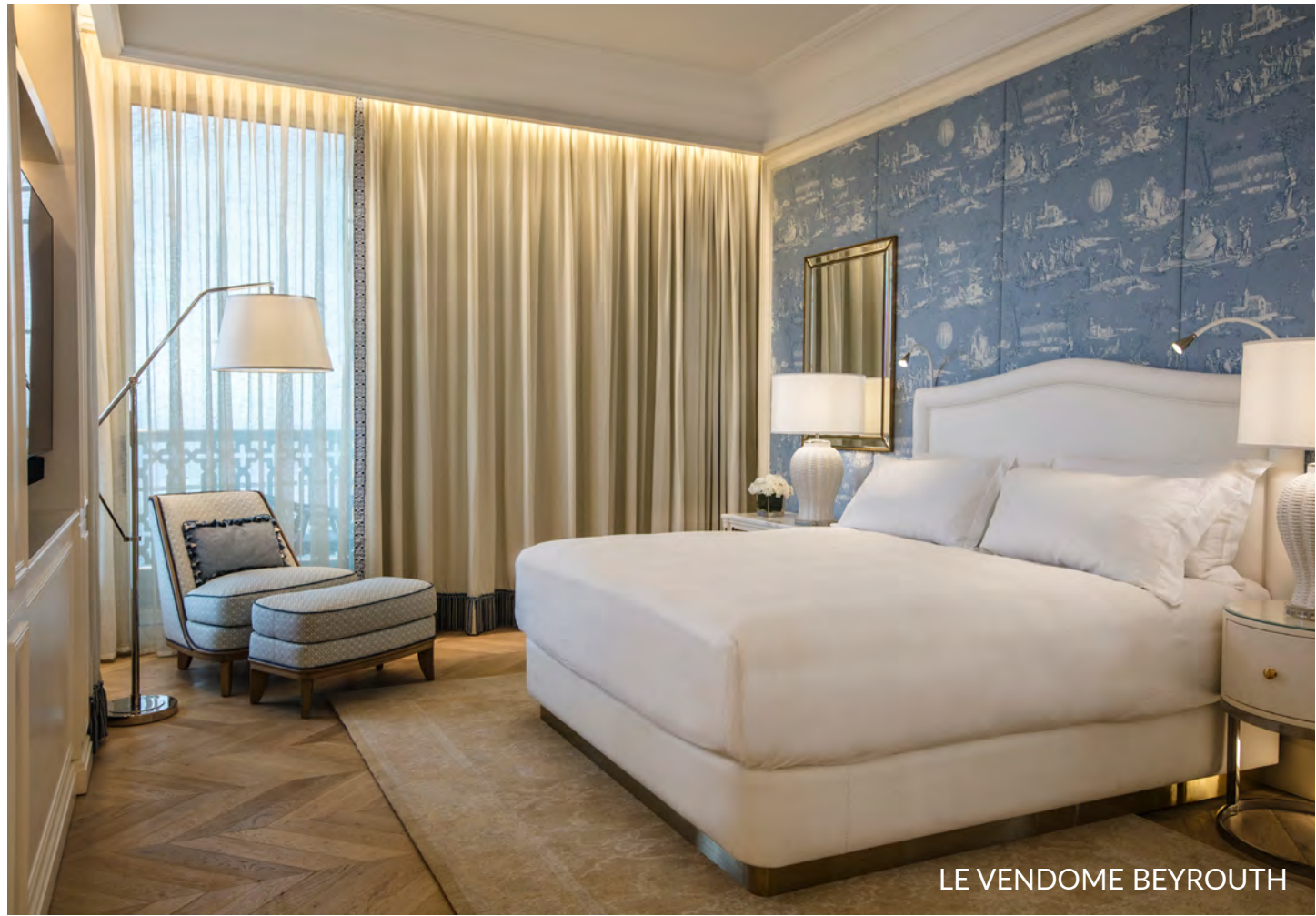
LE VENDOME BEYROUTH