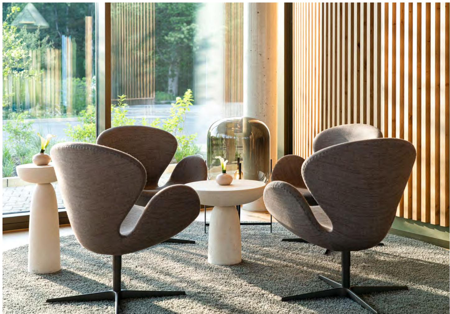
WALD WEIT HOTEL AND RETREAT, KIEDRICH