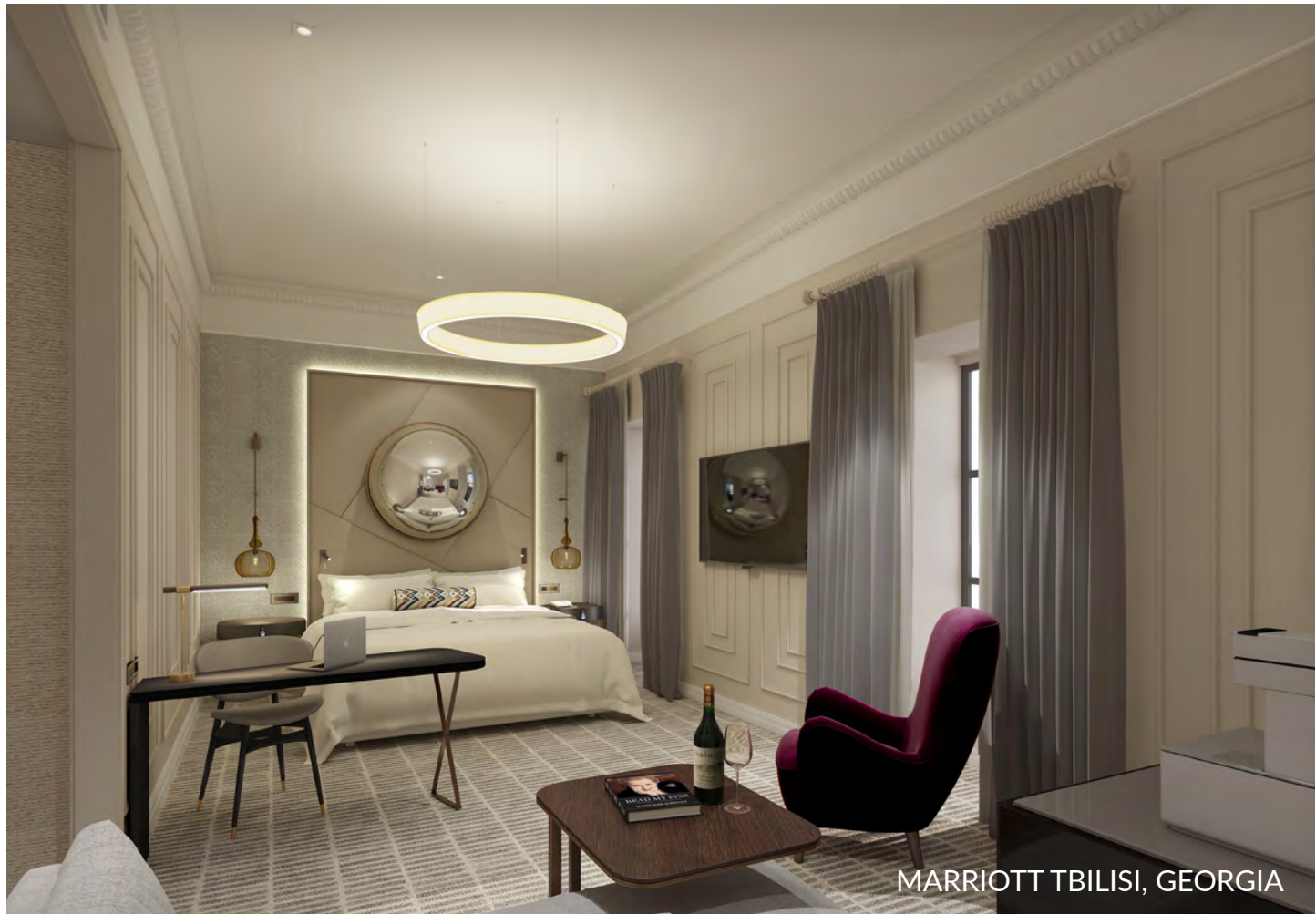
MARRIOTT TBILISI, GEORGIA