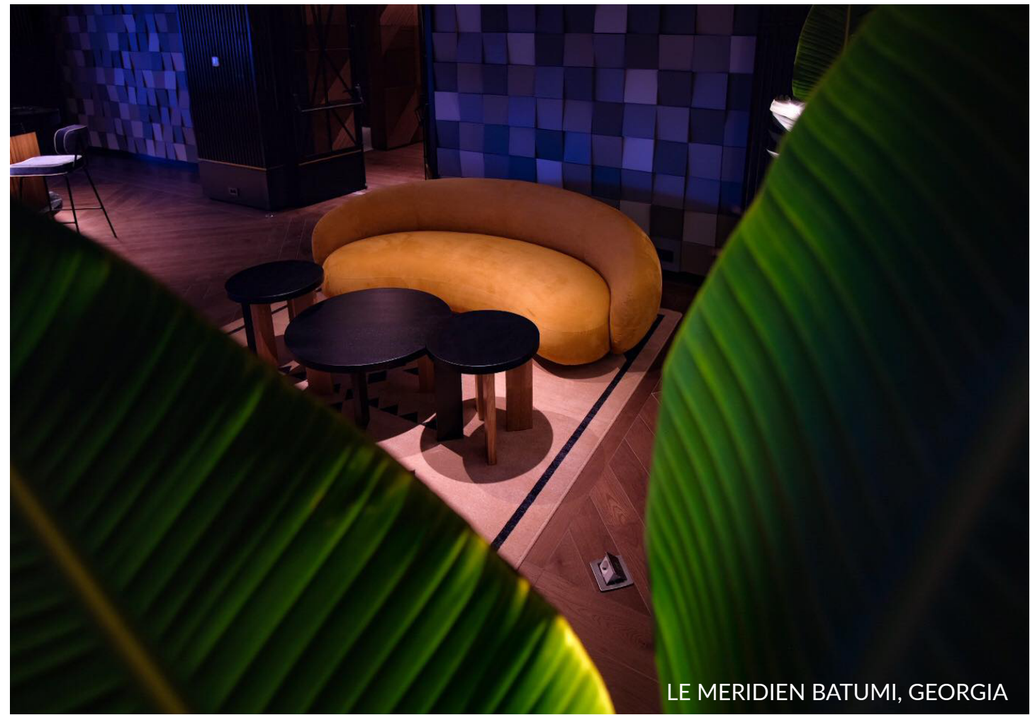
LE MERIDIEN BATUMI, GEORGIA