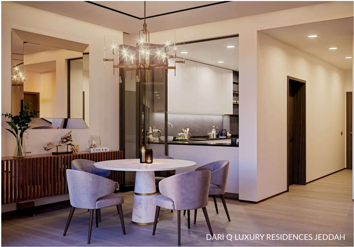
DARI Q LUXURY RESIDENCES JEDDAH