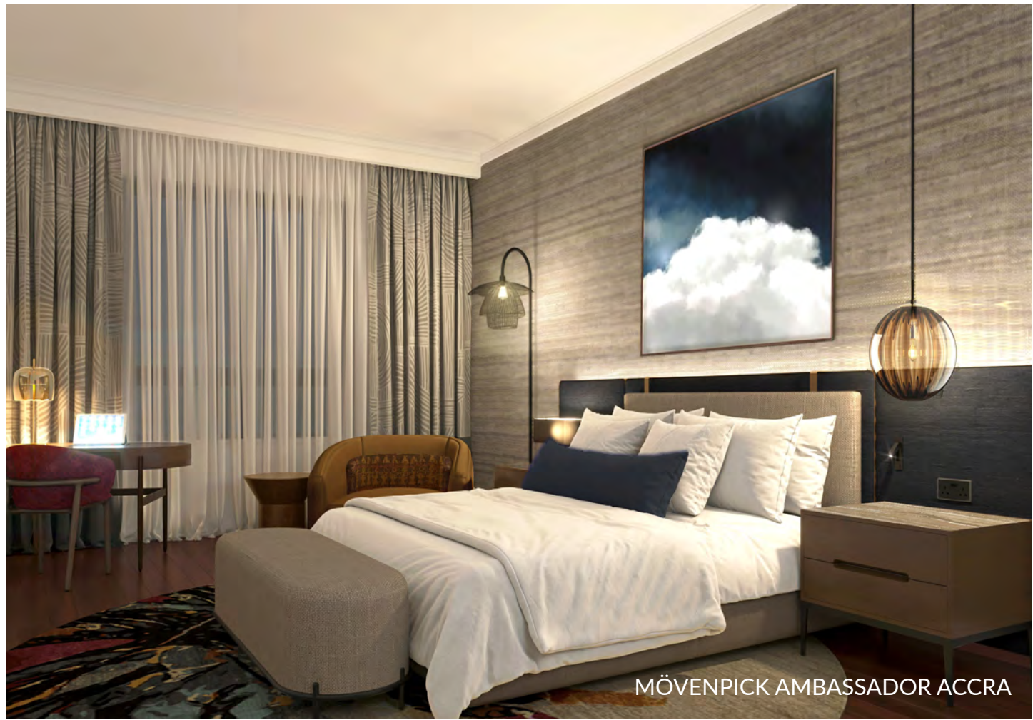
MÖVENPICK AMBASSADOR ACCRA