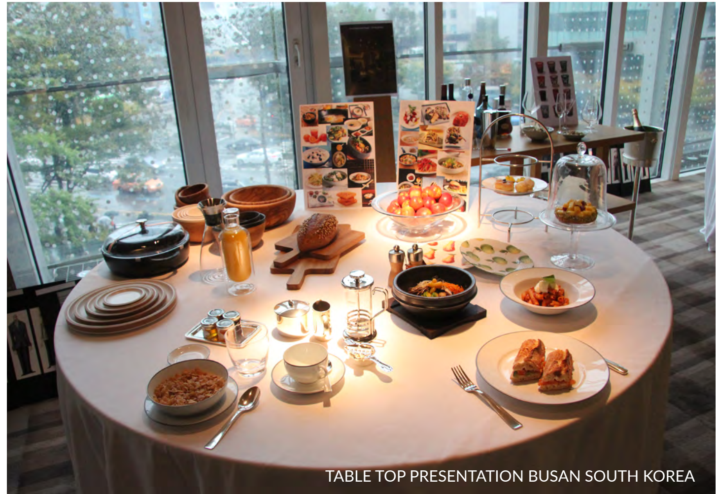
TABLE TOP PRESENTATION BUSAN SOUTH KOREA